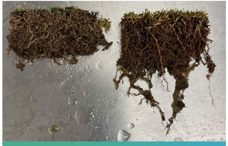
Roots of Untreated and Armorex + Bac-Pack Treated Plots, Cheraw State Park Golf Course Cheraw, SC.

Armorex is compatible with most surfactants and conventional pesticides. The most effective ambient temperature range for application is 60° to 85° F (15.7° to 29.7°C).