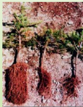
The plant on the left has been treated with Plant Success's unique formula, the centermost has simply been inoculated with mycorrhizal fungi, and the one on the right has not been treated.