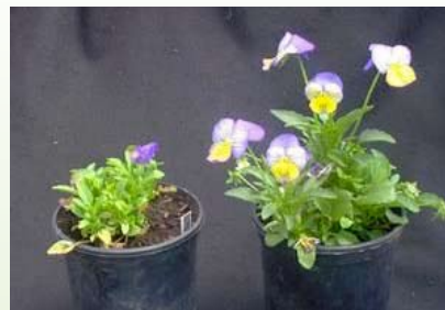
The pansy on the right was treated with Plant Success mycorrhizal granules and the one on the left was not.

Mycorrhizae-143,790 spores per c.c. Trichoderma 187,500 spores per c.c.